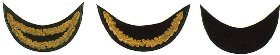
Flag Rank, Captain, Commander Senior Grade, Commander, Lieutenant Commander until Leading Seaman