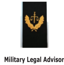
Military Legal Advisor