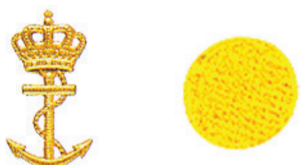
Naval Academy, Petty Officers School