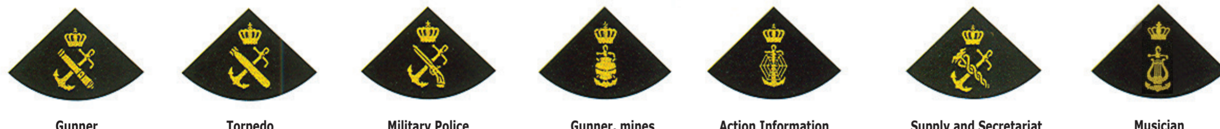
Gunner, Torpedo, Military Police, Gunner, mines, Action Information, Supply and Secretariat, Musician