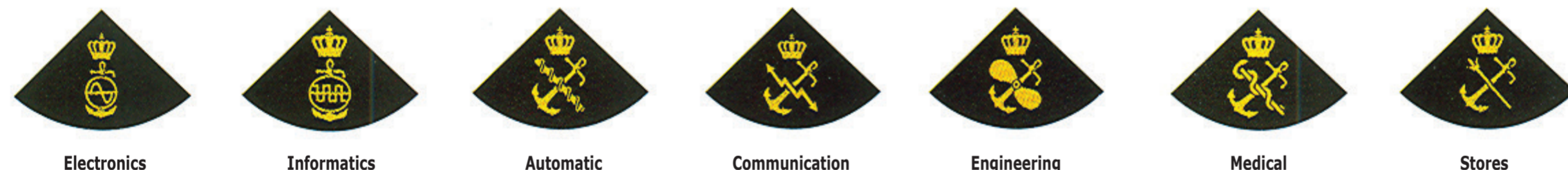
Electronics, Informatics, Automatic, Communication, Engineering, Medical, Stores