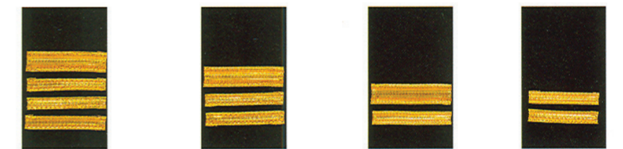
Senior Leading Mechanic, Leading Mechanic 1st class, Leading Mechanic 2nd class, Mechanic