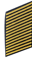
Each stripe represents 3 years of service