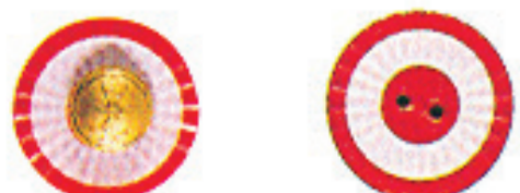
Anchor button, Regulars