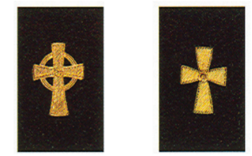
Naval Dean, Naval Chaplain