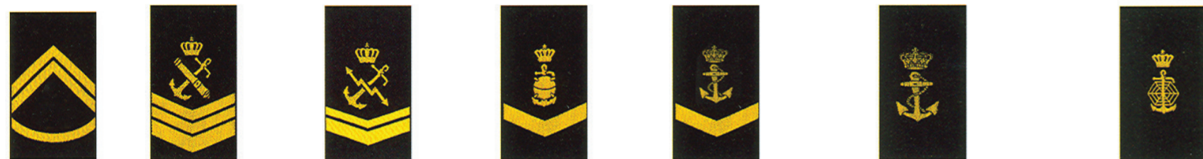
Leading Rating (OR-4), Able Rating (OR-3), Able Rating (OR-2), Junior Rating (OR-1), Junior Rating/Trainee/Conscript, Junior Rating/Trainee/Conscript, Action Information Conscript