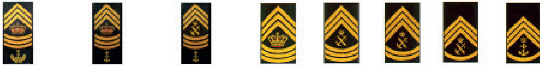
Master Chief Petty Officer of the Navy, Command Master Chief Petty Officer, Command Senior Chief Petty Officer, Master Chief Petty Officer (OR-9), Senior Chief Petty Officer (OR-8), Chief Petty Officer (OR-7), Petty Officer (Regular) (OR-5), Petty Officer (Conscript) (OR-5)